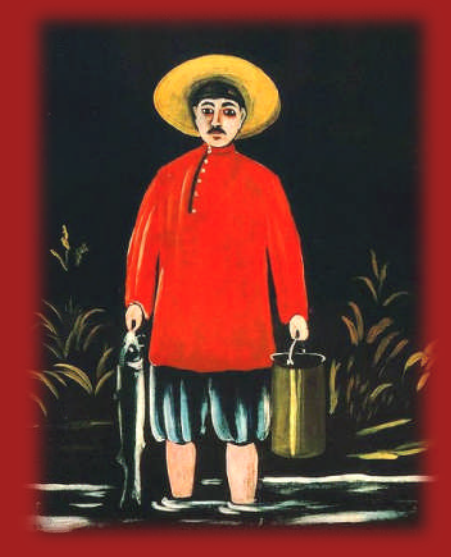
Fisherman by Niko Pirosmani