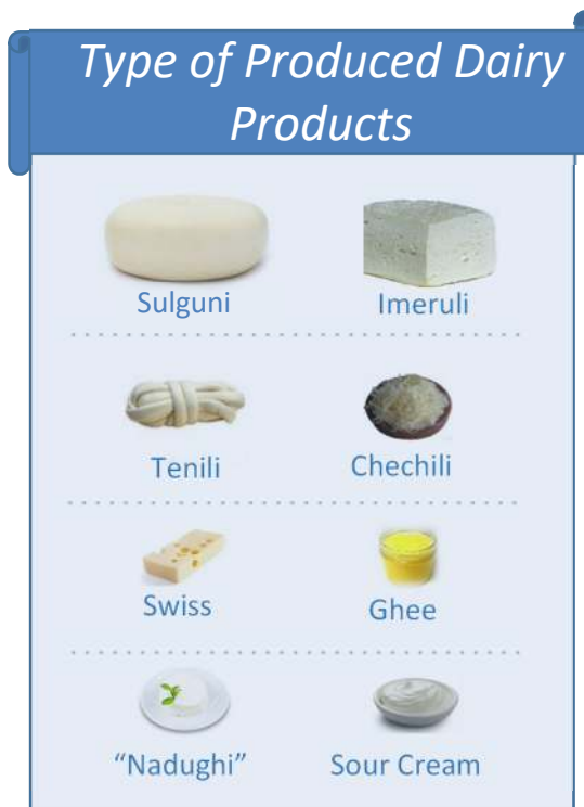
Figure 3. Diversified dairy product

Crowding in entities are understanding the value of FS&H for their business. All the crowding in entities are oriented on the quality of dairy products, they source raw milk from small livestock producers and are trying to fulfill all the FS&H requirements and establish HACCP. 60% of them are funded by the government grants and actively working with them and 40% cooperate with the ALCP clients, CNFA, USAID or to get information/funds to fulfill FS&H requirements and further establish HACCP.